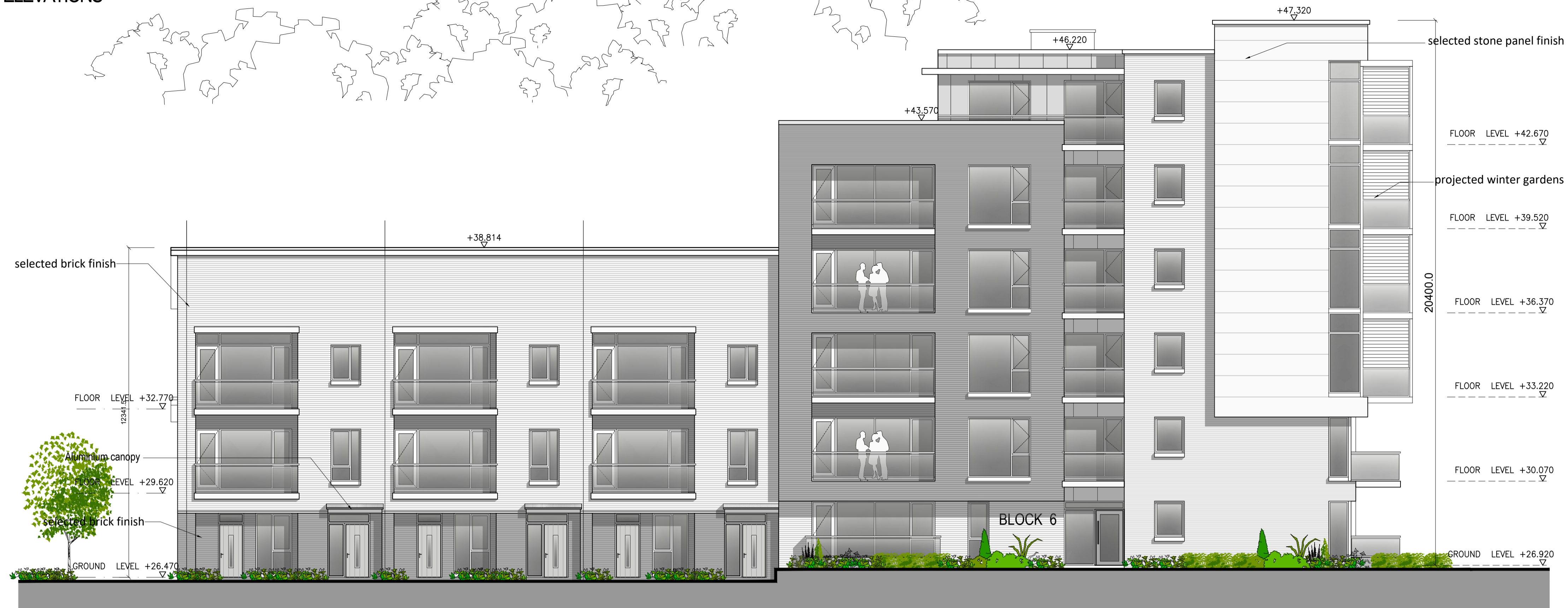
South West Elevation